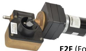
E2F (For EB6D Only) Position (non-CAN)