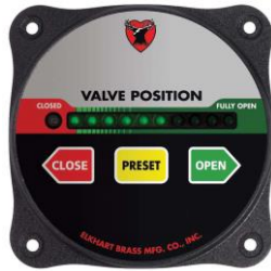
UBEC 1 (Primary)

NOTE: A Primary Controller can have only ONE Secondary Controller.