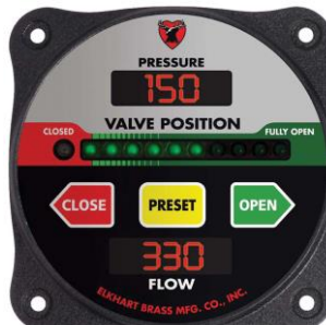
UBEC 3 (P/N 08899170)