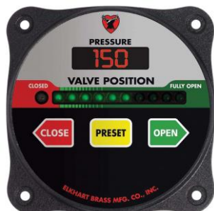
UBEC 2 (P/N 08899160)