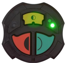
UBEC 1S (P/N 08899151)