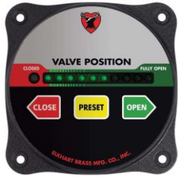
UBEC 1 (P/N 08899150)