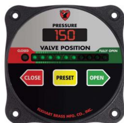
UBEC 2** (Secondary) (P/N 08899164)