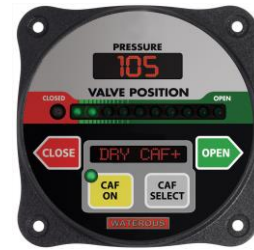
UICS 2** (Secondary) (P/N 08899194)

*Contact Elkhart Brass for available Harness length options. Length determined by distance from Primary Controller to Secondary Controller.