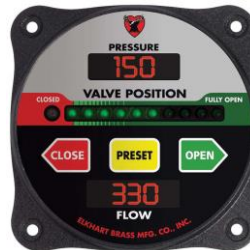
UBEC 3 (Primary)