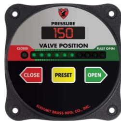
UBEC 2 (Primary)