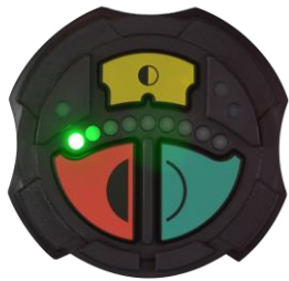
UBEC 1C (P/N 08899152)