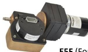
E5F (For EB6D Only) Position (CAN Enabled)