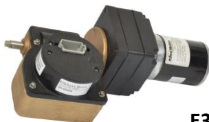
E3F Position (CAN Enabled)