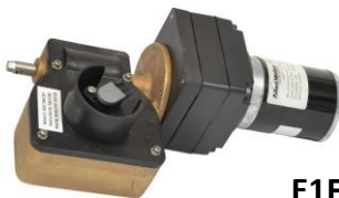
E1F Position (non-CAN)

Specify: - Pressure Sensor - Flow Sensor**