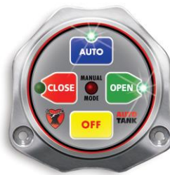
UBEC 1AT (50/95 - P/N 08899155)