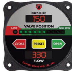
UBEC 3 (P/N 08899170)

Specify Harnesses*: - To Valve - To Pressure Sensor