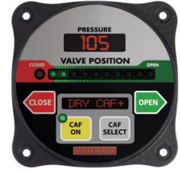
UICS 2 (P/N 08899190)

Specify Harnesses*: - To Valve - To Pressure & Flow Sensor