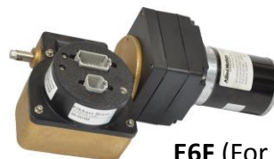
E6F (For EB6D Only) Position (CAN Enabled) with Flow and Pressure