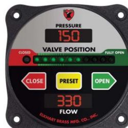
UBEC 3** (Secondary) (P/N 08899174)