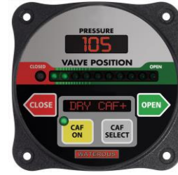
UICS 2 (Primary)