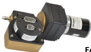
E4F Position (CAN Enabled) with Flow and Pressure

Specify: - Pressure Sensor - Flow Sensor**