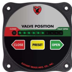
UBEC 1** (Secondary) (P/N 08899154)