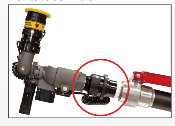
Monitor Side - Male

[May require additional adapters. Not provided by Elkhart Brass]